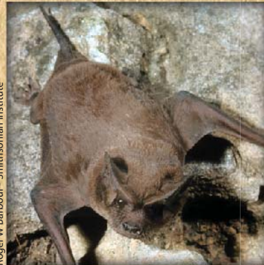
Brazilian Free-Tailed Bat Tadarida brasiliensis