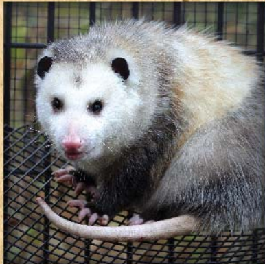
Virginia Opossum Didelphis virginiana