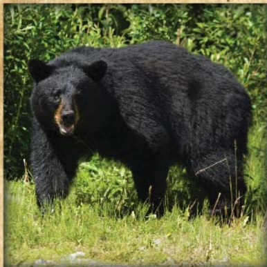
Black Bear Ursus americanus