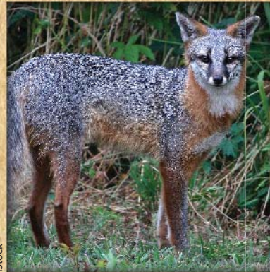
Gray Fox Urocyon cinereoargenteus