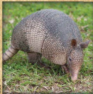
Nine-Banded Armadillo Dasypus novemcinctus