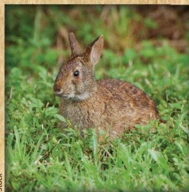
Marsh Rabbit Sylvilagus palustris