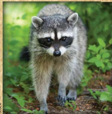
Raccoon Procyon lotor