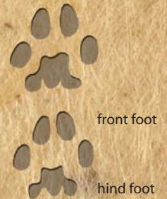
Bobcat Lynx rufus