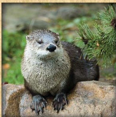
River Otter Lutra canadensis