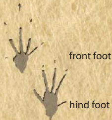
Southeastern Pocket Gopher Geomys pinetis