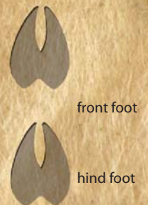
White-Tailed Deer Odocoileus virginianus