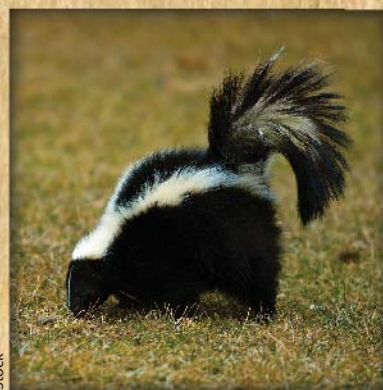
Striped Skunk Mephitis mephitis