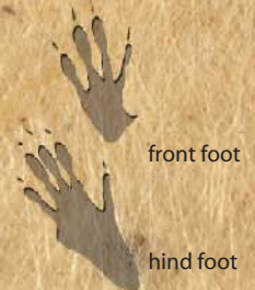
Sherman's Fox Squirrel Sciurus niger shermani