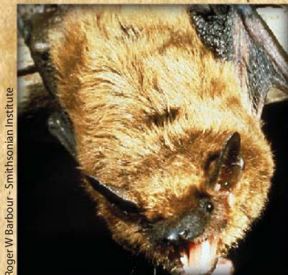
Big Brown Bat Eptesicus fuscus