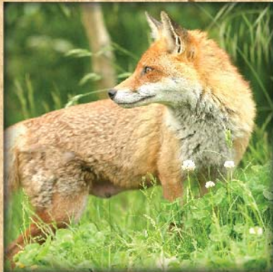
Red Fox Vulpes vulpes