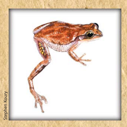
Pinewoods Treefrog Hyla femoralis