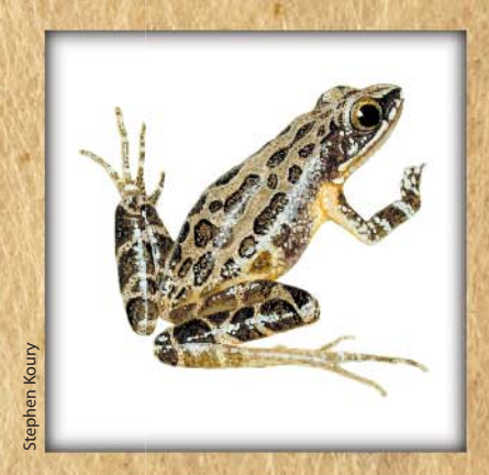
Florida Chorus Frog Pseudacris nigrita verrucosus