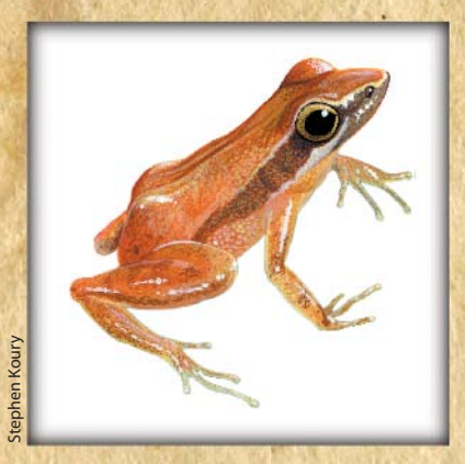
Little Grass Frog Pseudacris ocularis