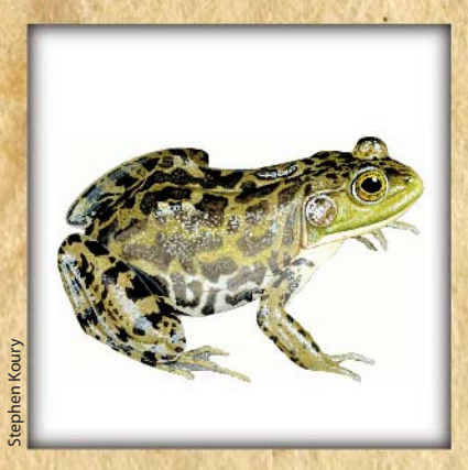
American Bullfrog Rana catesbeiana