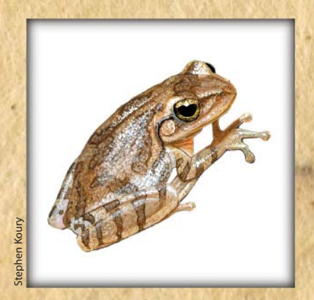
Cuban Treefrog Osteopilus septentrionalis