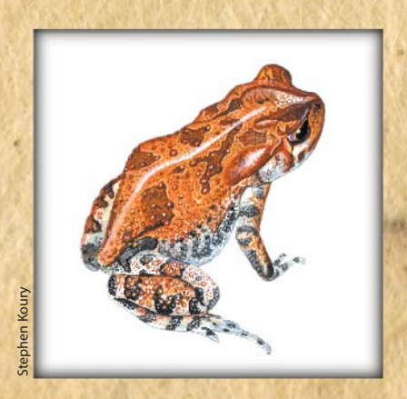
Southern Toad Bufo terrestris