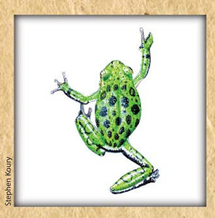
Barking Treefrog Hyla gratiosa