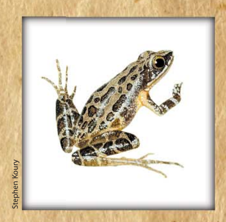
Florida Cricket Frog Acris gryllus dorsalis