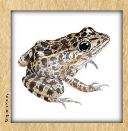
Florida Gopher Frog Rana capito aesopus