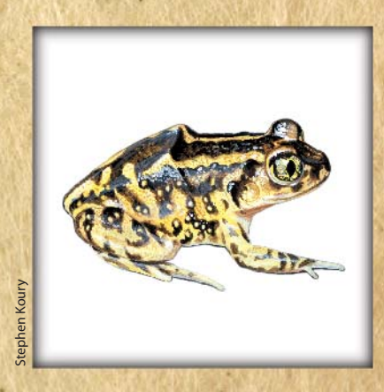
Eastern Spadefoot Toad Scaphiopus holbrookii holbrookii