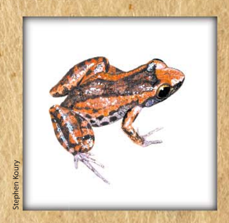
Greenhouse Frog Eleutherodactylus planirostris planirostris