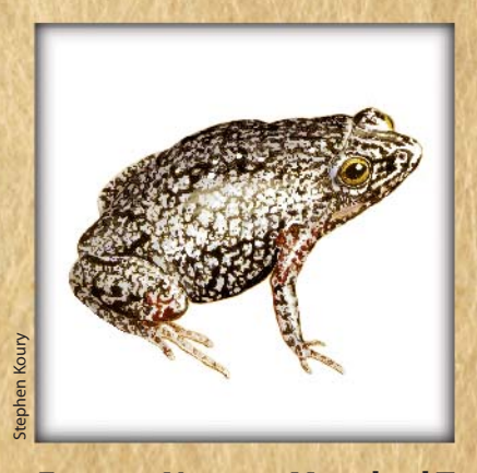
Eastern Narrow-Mouthed Toad Gastrophryne carolinensis