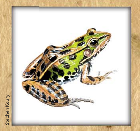
Southern Leopard Frog Rana sphenocephala