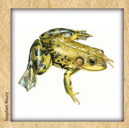
Pig Frog Rana grylio