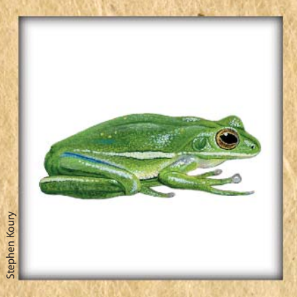
Green Treefrog Hyla cinerea