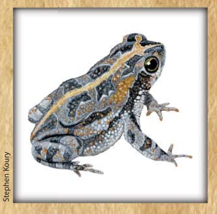
Oak Toad Bufo quercicus