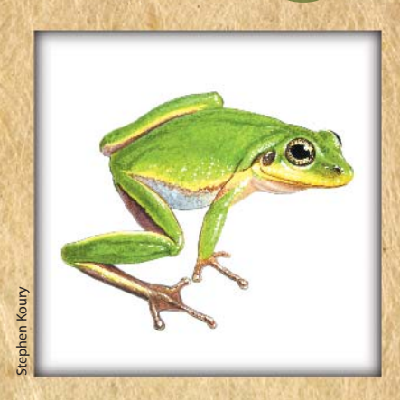
Squirrel Treefrog Hyla squirella