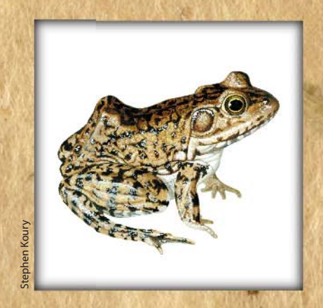
River Frog Rana heckscheri