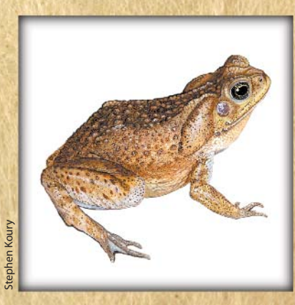
Cane Toad Bufo marinus