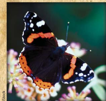
Red Admiral Vanessa atalanta