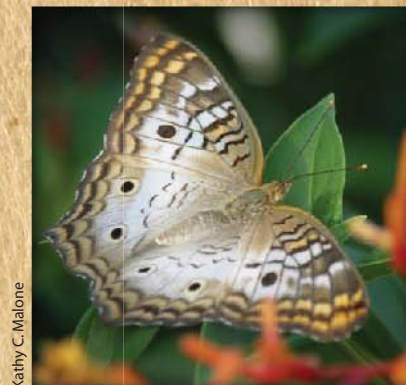
White Peacock Anartia jatrophae