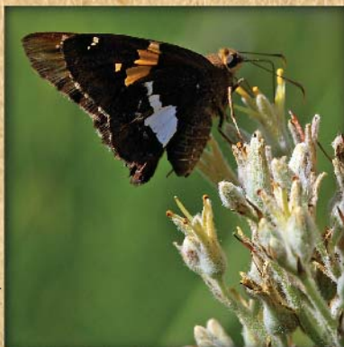
Silver-Spotted Skipper Epargyreus clarus