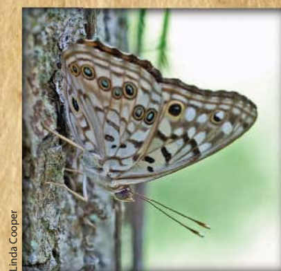
Hackberry Emperor Asterocampa celtis