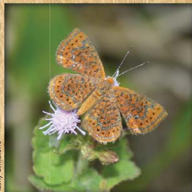
Little Metalmark Calephelis virginensis