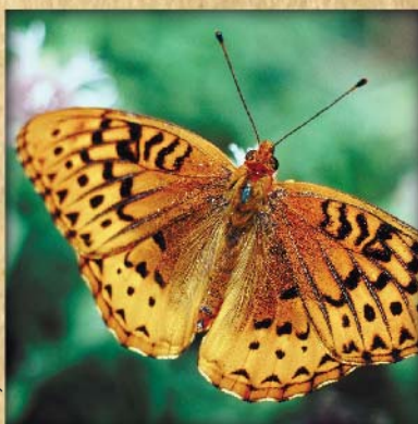
Variegated Fritillary Euptoieta claudia