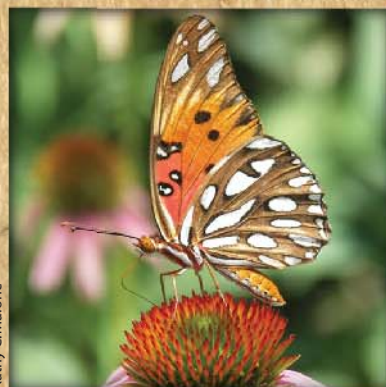
Gulf Fritillary Agraulis vanillae