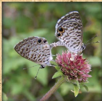
Cassius Blue Leptotes cassius