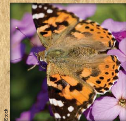
Painted Lady Vanessa cardui