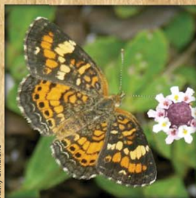
Phaon Crescent Phyciodes phaon