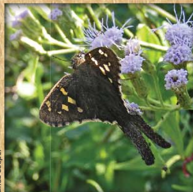
Dorantes Longtail Urbanus dorantes