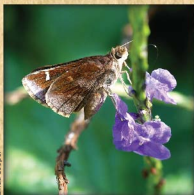
Clouded Skipper Lerema accius