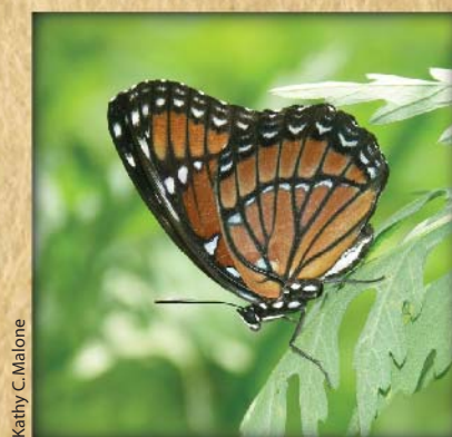
Viceroy Limenitis archippus