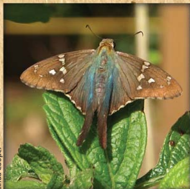
Long-Tailed Skipper Urbanus proteus