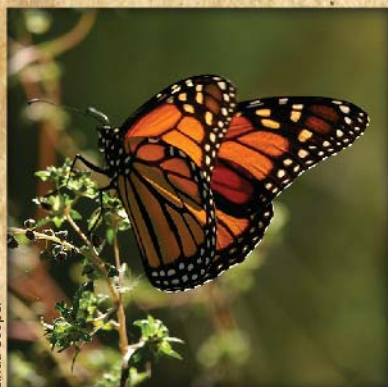
Monarch Danaus plexippus