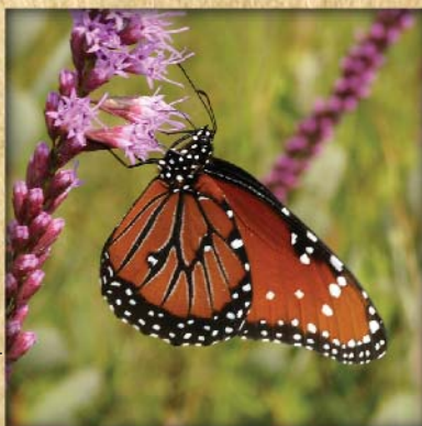
Queen Danaus gilippus