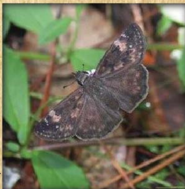
Zarucco Duskywing Erynnis zarucco