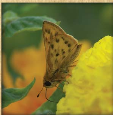
Fiery Skipper Hylephila phyleus