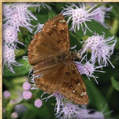
Horace's Duskywing Erynnis horatius