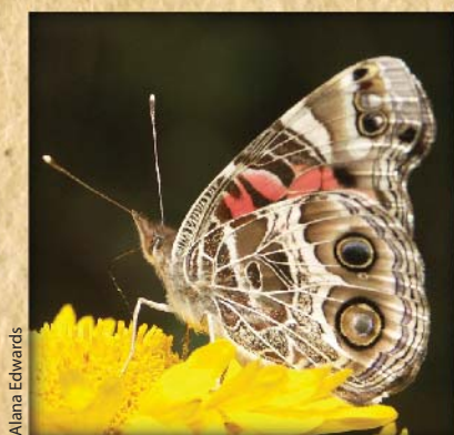
American Lady Vanessa virginiensis