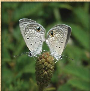
Ceraunus Blue Hemiargus ceraunus