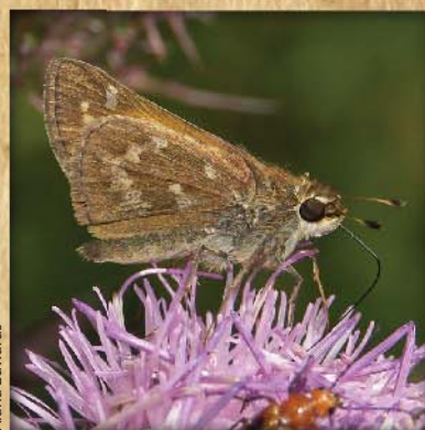
Sachem Atalopedes campestris