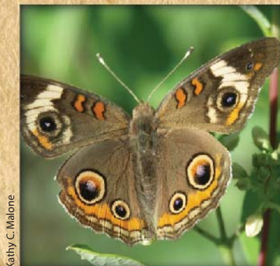
Common Buckeye Junonia coenia