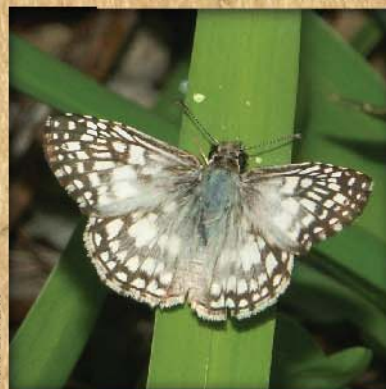
Tropical Checkered-Skipper Pyrgus oileus