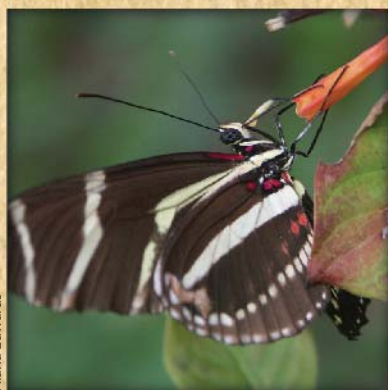
Zebra Heliconian Heliconius charithonia