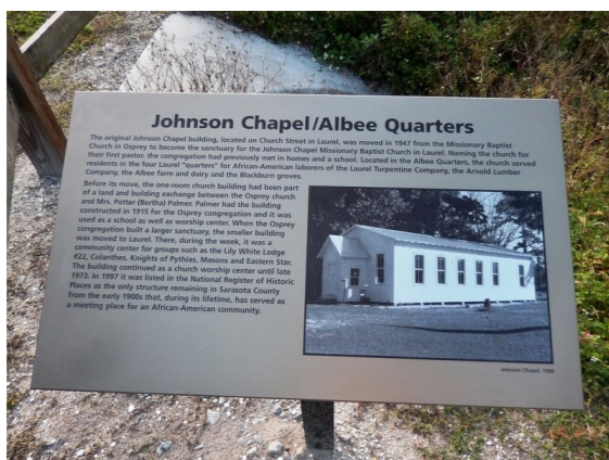
December 3, 2014