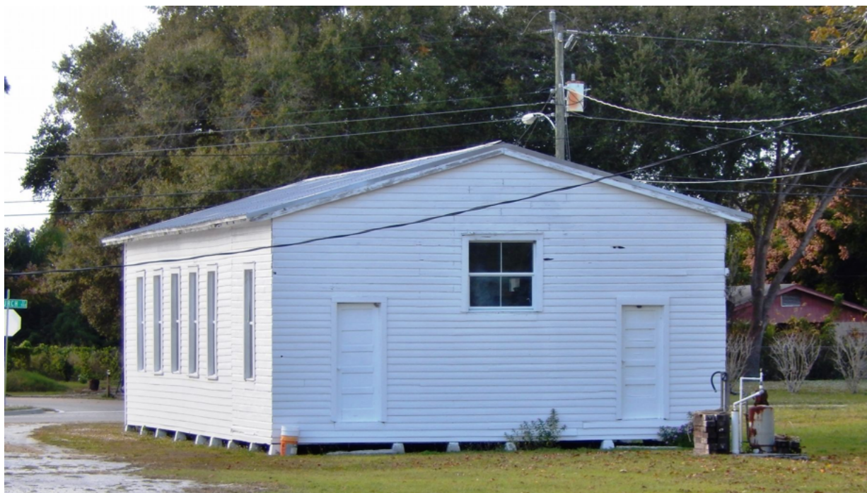
December 3, 2014