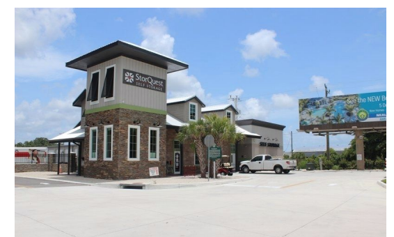
3. Woodmere Marker and surrounding area.